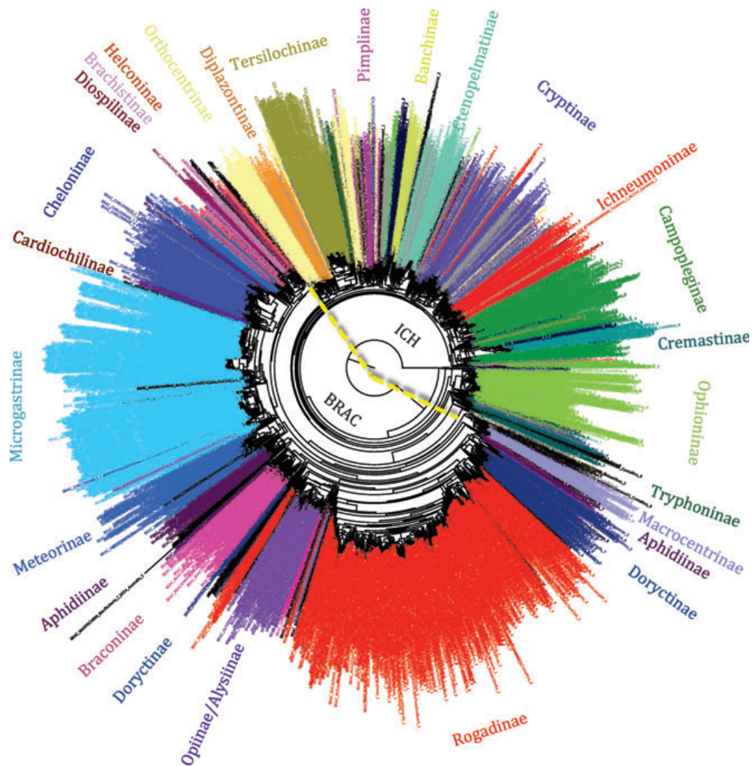
Fig. 2 Circular maximum likelihood phylogram from analysis of the whole data set, differentially colour coded for all major subfamilies and with unassigned taxa coloured grey.

many as monophyletic, and therefore, using parsimony or likelihood, any COI sequence of unknown subfamily level identity might currently be misplaced.