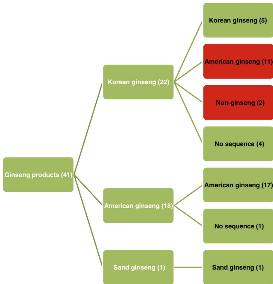
Fig. 2. Flowchart comparing commercial label and DNA barcode identification of ginseng products.

shark fin products and 91% of the mislabelled ginseng products included in our study were purchased at informal markets.