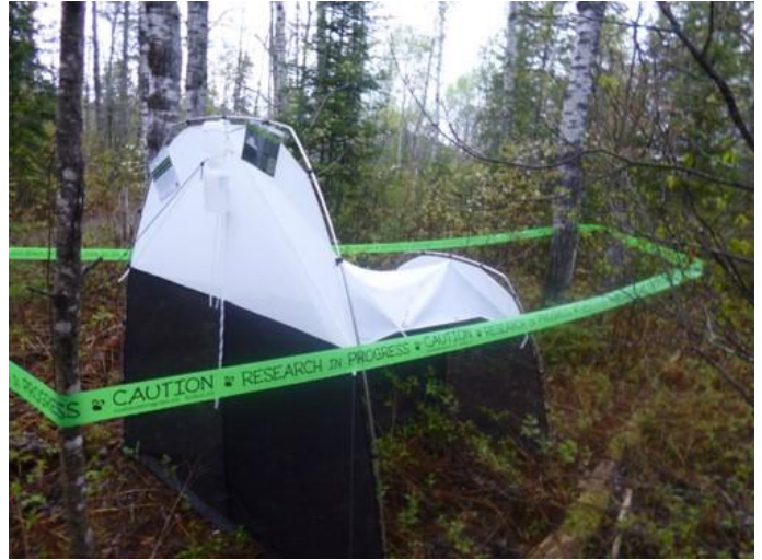
Figure 1. Malaise trap deployed at Bell Bay Provincial Park in 2014.

Over half the BINs captured were flies (Diptera), followed by bees, ants and wasps (Hymenoptera), moths and butterflies (Lepidoptera), and beetles (Coleoptera; Figure 2). In total, 607 arthropod species were named, representing 21.5% of the BINs from the site (Appendix 1). All but 2 of the BINs were assigned at least to family, and 59.8% were assigned to a genus (Appendix 2). Specimens collected from Bell Bay represent 201 different families and 760 genera.