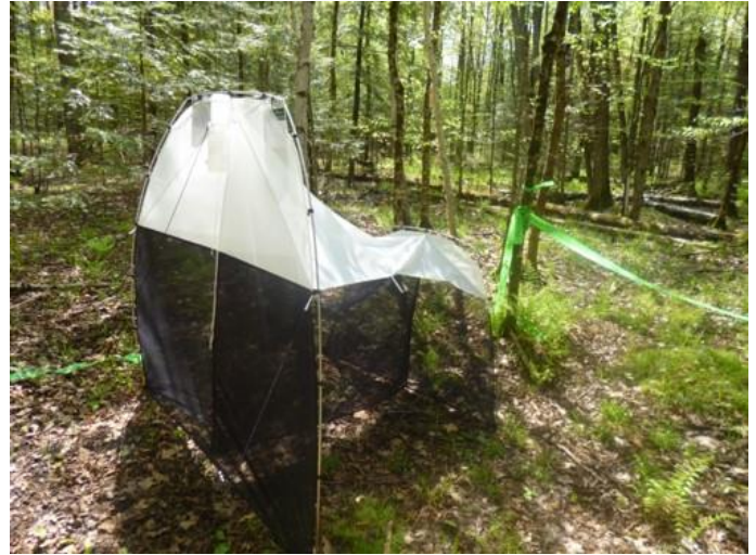
Figure 1. Malaise trap deployed at Bon Echo Provincial Park in 2014.

Over half the BINs captured were flies (Diptera), followed by bees, ants and wasps (Hymenoptera), moths and butterflies (Lepidoptera), and beetles (Coleoptera; Figure 2). In total, 547 arthropod species were named, representing 22.9% of the BINs from the site (Appendix 1). All BINs were assigned at least to family, and 57.2% were assigned to a genus (Appendix 2). Specimens collected from Bon Echo represent 223 different families and 651 genera.