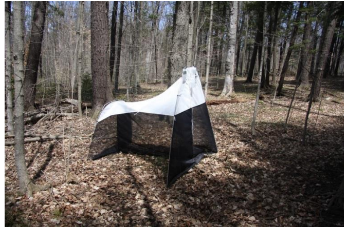
Figure 1. Malaise trap deployed at Emily Provincial Park in 2014.

Over half the BINs captured were flies (Diptera), followed by bees, ants and wasps (Hymenoptera), moths and butterflies (Lepidoptera), and true bugs (Hemiptera; Figure 2). In total, 442 arthropod species were named, representing 29.2% of the BINs from the site (Appendix 1). All the BINs were assigned at least to family, and 65.8% were assigned to a genus (Appendix 2). Specimens collected from Emily represent 155 different families and 529 genera.