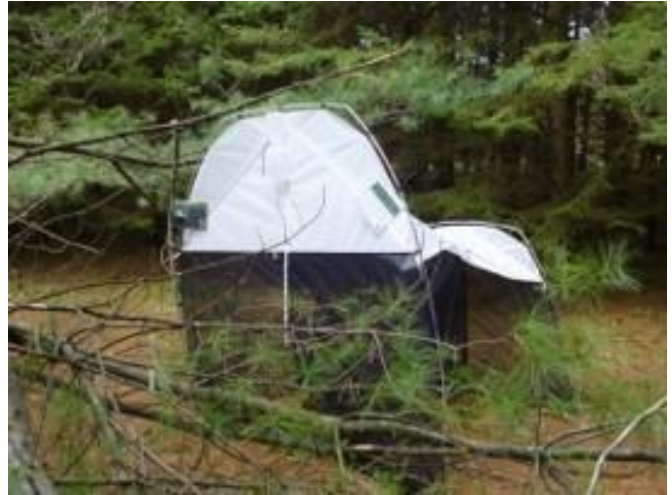
Figure 1. Malaise trap deployed at Forks of the Credit Provincial Park in 2014.

Over half the BINs captured were flies (Diptera), followed by bees, ants and wasps (Hymenoptera), moths and butterflies (Lepidoptera), and true bugs (Hemiptera; Figure 2). In total, 684 arthropod species were named, representing 28.5% of the BINs from the site (Appendix 1). All the BINs were assigned at least to family, and 64.3% were assigned to a genus (Appendix 2). Specimens collected from Forks of the Credit represent 185 different families and 719 genera.