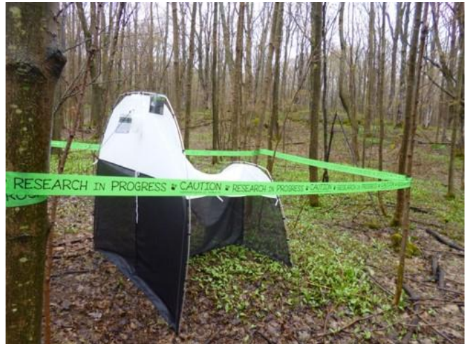
Figure 1. Malaise trap deployed at Hope Bay Forest Provincial Park in 2014.

Over half the BINs captured were flies (Diptera), followed by moths and butterflies (Lepidoptera), bees, ants and wasps (Hymenoptera), and beetles (Coleoptera; Figure 2). In total, 289 arthropod species were named, representing 34% of the BINs from the site (Appendix 1). All the BINs were assigned at least to family, and 67.9% were assigned to a genus (Appendix 2). Specimens collected from Hope Bay Forest represent 123 different families and 346 genera.