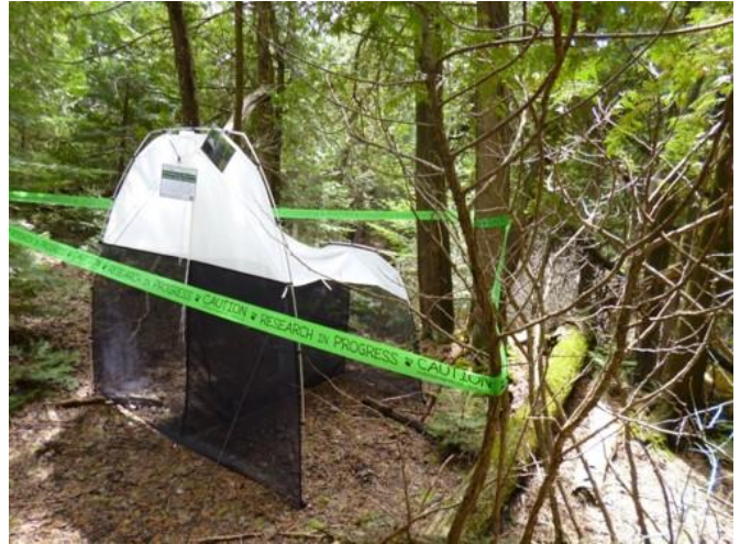
Figure 1. Malaise trap deployed at Inverhuron Provincial Park in 2014.

Over half the BINs captured were flies (Diptera), followed by bees, ants and wasps (Hymenoptera), moths and butterflies (Lepidoptera), and beetles (Coleoptera; Figure 2). In total, 422 arthropod species were named, representing 26.9% of the BINs from the site (Appendix 1). All the BINs were assigned at least to family, and 58.4% were assigned to a genus (Appendix 2). Specimens collected from Inverhuron represent 198 different families and 530 genera.