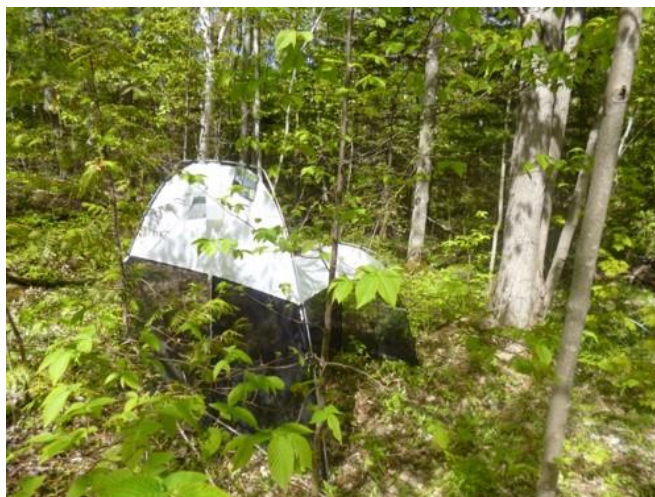
Figure 1. Malaise trap deployed at Lion's Head Provincial Park in 2014.

Over half the BINs captured were flies (Diptera), followed by bees, ants and wasps (Hymenoptera), moths and butterflies (Lepidoptera), and true bugs (Hemiptera; Figure 2). In total, 442 arthropod species were named, representing 23.8% of the BINs from the site (Appendix 1). All the BINs were assigned at least to family, and 57.9% were assigned to a genus (Appendix 2). Specimens collected from Lion's Head represent 186 different families and 555 genera.