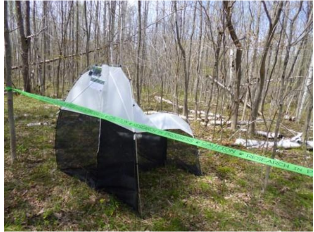
Figure 1. Malaise trap deployed at MacGregor Point Provincial Park in 2014.

Over half the BINs captured were flies (Diptera), followed by bees, ants and wasps (Hymenoptera), moths and butterflies (Lepidoptera), and beetles (Coleoptera; Figure 2). In total, 595 arthropod species were named, representing 28.2% of the BINs from the site (Appendix 1). All the BINs were assigned at least to family, and 62.4% were assigned to a genus (Appendix 2). Specimens collected from MacGregor Point represent 186 different families and 667 genera.