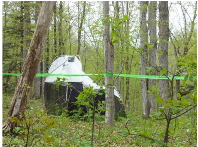
Figure 1. Malaise trap deployed at Morris Tract Provincial Park in 2014.

Over half the BINs captured were flies (Diptera), followed by moths and butterflies (Lepidoptera), bees, ants and wasps (Hymenoptera), and true bugs (Hemiptera; Figure 2). In total, 434 arthropod species were named, representing 29.6% of the BINs from the site (Appendix 1). All but 1 of the BINs were assigned at least to family, and 64.3% were assigned to a genus (Appendix 2). Specimens collected from Morris Tract represent 198 different families and 517 genera.