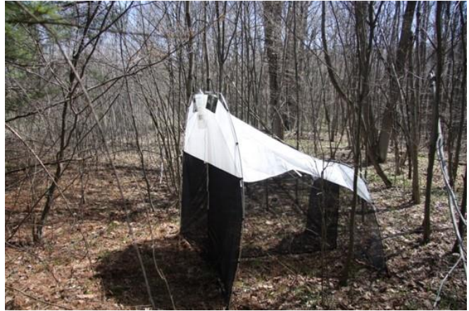
Figure 1. Malaise trap deployed at Murphy's Point Provincial Park in 2014.

Over half the BINs captured were flies (Diptera), followed by bees, ants and wasps (Hymenoptera), moths and butterflies (Lepidoptera), and beetles (Coleoptera; Figure 2). In total, 930 arthropod species were named, representing 23.1% of the BINs from the site (Appendix 1). All but 2 of the BINs were assigned at least to family, and 55.2% were assigned to a genus (Appendix 2). Specimens collected from Murphy's Point represent 250 different families and 954 genera.