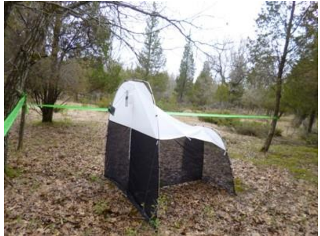
Figure 1. Malaise trap deployed at Pinery Provincial Park in 2014.

Half of the BINs captured were flies (Diptera), followed by bees, ants and wasps (Hymenoptera), moths and butterflies (Lepidoptera), and beetles (Coleoptera; Figure 2). In total, 956 arthropod species were named, representing 29.3% of the BINs from the site (Appendix 1). All but 3 of the BINs were assigned at least to family, and 63.6% were assigned to a genus (Appendix 2). Specimens collected from Pinery represent 215 different families and 743 genera.