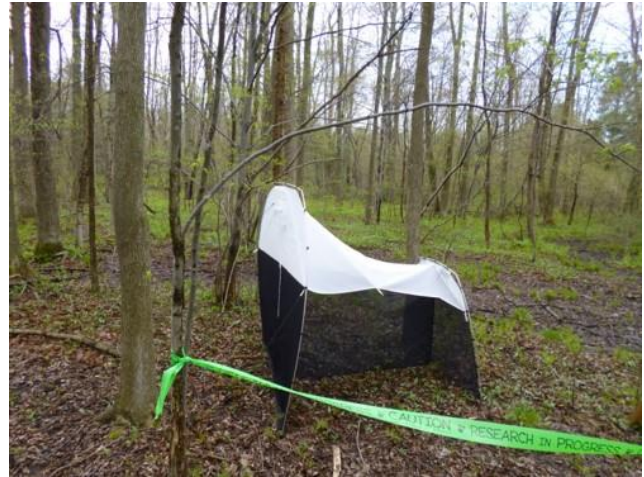
Figure 1. Malaise trap deployed at Port Burwell Provincial Park in 2014.

Over half the BINs captured were flies (Diptera), followed by moths and butterflies (Lepidoptera), bees, ants and wasps (Hymenoptera), and beetles (Coleoptera; Figure 2). In total, 467 arthropod species were named, representing 32.5% of the BINs from the site (Appendix 1). All the BINs were assigned at least to family, and 63.3% were assigned to a genus (Appendix 2). Specimens collected from Port Burwell represent 131 different families and 383 genera.