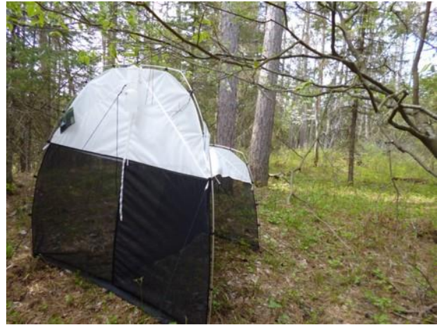
Figure 1. Malaise trap deployed at Petroglyphs Provincial Park in 2014.

Over half the BINs captured were flies (Diptera), followed by bees, ants and wasps (Hymenoptera), moths and butterflies (Lepidoptera), and beetles (Coleoptera; Figure 2). In total, 652 arthropod species were named, representing 25.2% of the BINs from the site (Appendix 1). All the BINs were assigned at least to family, and 62.1% were assigned to a genus (Appendix 2). Specimens collected from Petroglyphs represent 183 different families and 717 genera.