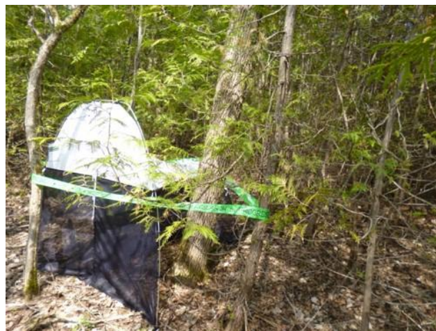
Figure 1. Malaise trap deployed at Sibbald Point Provincial Park in 2014.

Over half the BINs captured were flies (Diptera), followed by bees, ants and wasps (Hymenoptera), beetles (Coleoptera), and moths and butterflies (Lepidoptera; Figure 2). In total, 399 arthropod species were named, representing 26.9% of the BINs from the site (Appendix 1). All the BINs were assigned at least to family, and 60.6% were assigned to a genus (Appendix 2). Specimens collected from Sibbald Point represent 160 different families and 473 genera.