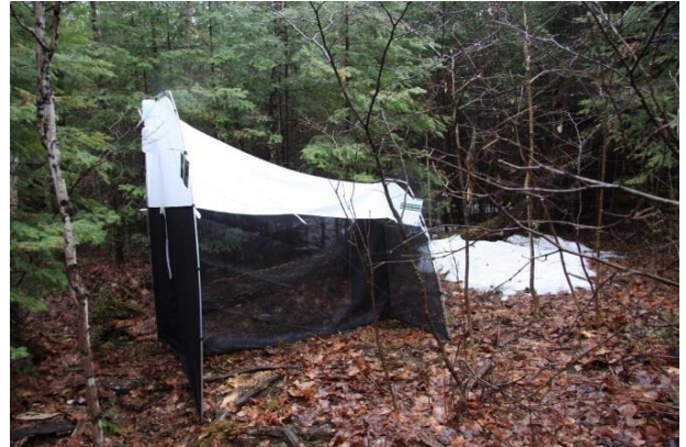
Figure 1. Malaise trap deployed at Silent Lake Provincial Park in 2014.

Over half the BINs captured were flies (Diptera), followed by bees, ants and wasps (Hymenoptera), moths and butterflies (Lepidoptera), and beetles (Coleoptera; Figure 2). In total, 520 arthropod species were named, representing 22% of the BINs from the site (Appendix 1). All the BINs were assigned at least to family, and 56.1% were assigned to a genus (Appendix 2). Specimens collected from Silent Lake represent 180 different families and 622 genera.