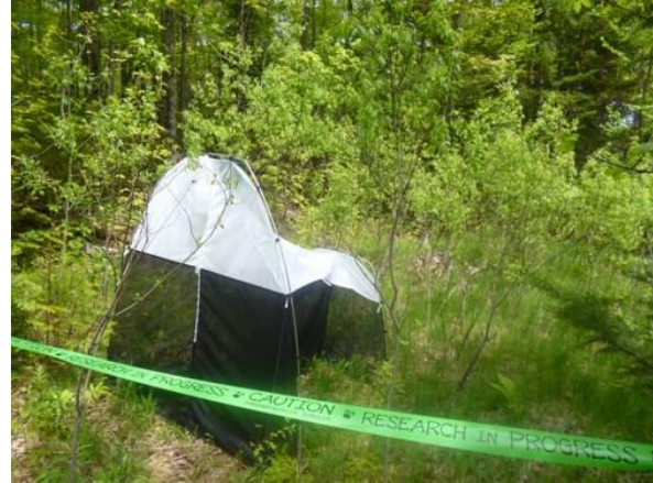
Figure 1. Malaise trap deployed at Silver Lake Provincial Park in 2014.

Over half the BINs captured were flies (Diptera), followed by bees, ants and wasps (Hymenoptera), moths and butterflies (Lepidoptera), and beetles (Coleoptera; Figure 2). In total, 994 arthropod species were named, representing 25.6% of the BINs from the site (Appendix 1). All the BINs were assigned at least to family, and 60.5% were assigned to a genus (Appendix 2). Specimens collected from Silver Lake represent 222 different families and 1012 genera.