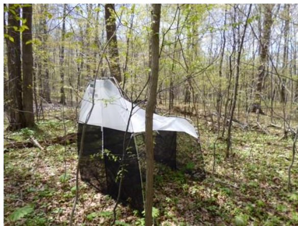
Figure 1. Malaise trap deployed at Wheatley Provincial Park in 2014.

Over half the BINs captured were flies (Diptera), followed by bees, ants and wasps (Hymenoptera), moths and butterflies (Lepidoptera), and beetles (Coleoptera; Figure 2). In total, 294 arthropod species were named, representing 28.9% of the BINs from the site (Appendix 1). All the BINs were assigned at least to family, and 58.1% were assigned to a genus (Appendix 2). Specimens collected from Wheatley represent 140 different families and 371 genera.