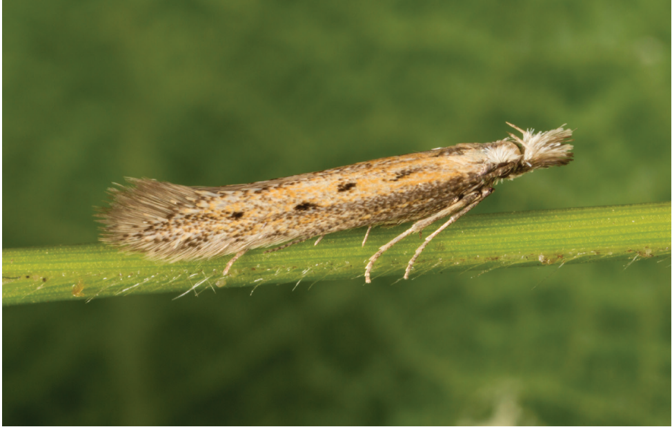
Figure 1. Megacraspedus teriolensis is a characteristic example of gelechiid moths only recognised and described during the last few years.