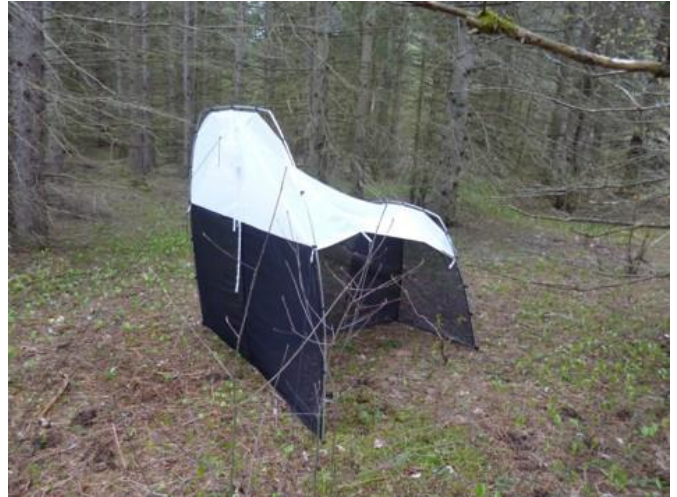
Figure 1. Malaise trap deployed at Awenda Provincial Park in 2014.

One Malaise trap was deployed at Awenda Provincial Park in 2014 (44.82534, -79.98458, 231m ASL; Figure 1). This trap collected arthropods for twenty weeks from April 29 – September 19, 2014. All 10 Malaise trap samples were processed; every other sample was analyzed using the individual specimen protocol while the second half was analyzed via bulk analysis. A total of 3029 BINs were obtained.