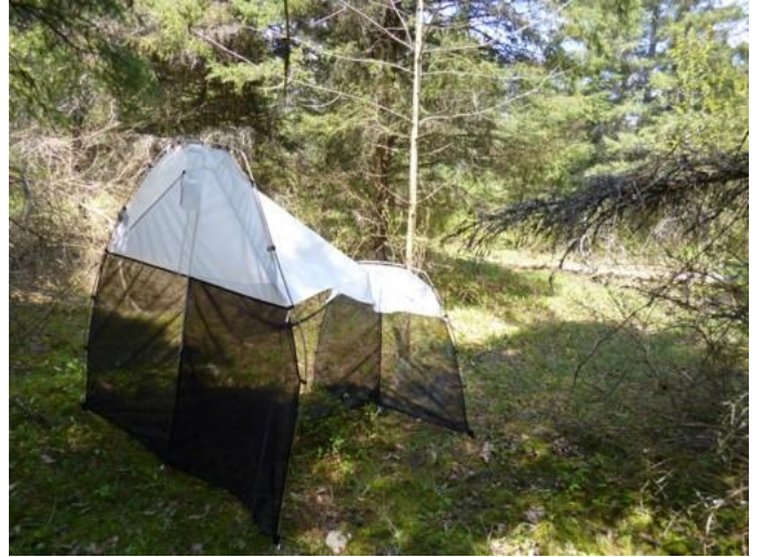
Figure 1. Malaise trap deployed at Balsam Lake Provincial Park in 2014.

Over half the BINs captured were flies (Diptera), followed by bees, ants and wasps (Hymenoptera), moths and butterflies (Lepidoptera), and true bugs (Hemiptera; Figure 2). In total, 703 arthropod species were named, representing 24.3% of the BINs from the site (Appendix 1). All the BINs were assigned at least to family, and 58.9% were assigned to a genus (Appendix 2). Specimens collected from Balsam Lake represent 224 different families and 811 genera.