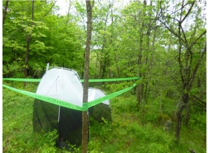
Figure 1. Malaise trap deployed at Frontenac Provincial Park in 2014.

Half of the BINs captured were flies (Diptera), followed by bees, ants and wasps (Hymenoptera), moths and butterflies (Lepidoptera), and true bugs (Hemiptera; Figure 2). In total, 750 arthropod species were named, representing 24.6% of the BINs from the site (Appendix 1). All but 1 of the BINs were assigned at least to family, and 58.2% were assigned to a genus (Appendix 2). Specimens collected from Frontenac represent 232 different families and 838 genera.