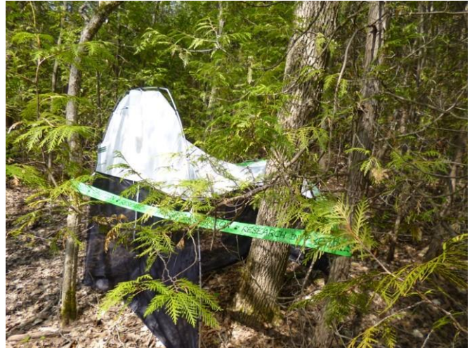
Figure 1. Malaise trap deployed at Holland Landing Prairie Provincial Park in 2014.

Over half the BINs captured were flies (Diptera), followed by bees, ants and wasps (Hymenoptera), moths and butterflies (Lepidoptera), and true bugs (Hemiptera; Figure 2). In total, 544 arthropod species were named, representing 26.1% of the BINs from the site (Appendix 1). All the BINs were assigned at least to family, and 60.5% were assigned to a genus (Appendix 2). Specimens collected from Holland Landing Prairie represent 165 different families and 623 genera.