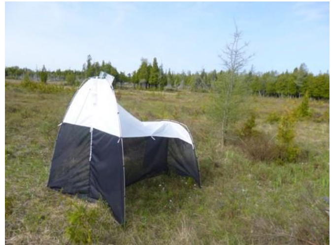
Figure 1. Malaise trap deployed at Johnston Harbour-Pine Tree Point Provincial Park in 2014.

Over half the BINs captured were flies (Diptera), followed by moths and butterflies (Lepidoptera), bees, ants and wasps (Hymenoptera), and beetles (Coleoptera; Figure 2). In total, 442 arthropod species were named, representing 27.8% of the BINs from the site (Appendix 1). All the BINs were assigned at least to family, and 65.1% were assigned to a genus (Appendix 2). Specimens collected from Johnston Harbour-Pine Tree Point represent 149 different families and 485 genera.