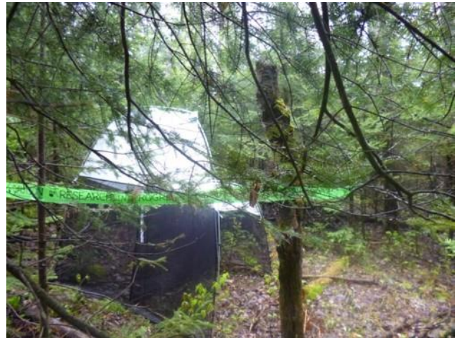
Figure 1. Malaise trap deployed at Lower Madawaska River Provincial Park in 2014.

One Malaise trap was deployed at Lower Madawaska River Provincial Park in 2014 (45.25606, -77.19221, 280m ASL; Figure 1). This trap collected arthropods for twenty weeks from May 7 – September 24, 2014. All 10 Malaise trap samples were processed; every other sample was analyzed using the individual specimen protocol while the second half was analyzed via bulk analysis. A total of 3229 BINs were obtained.