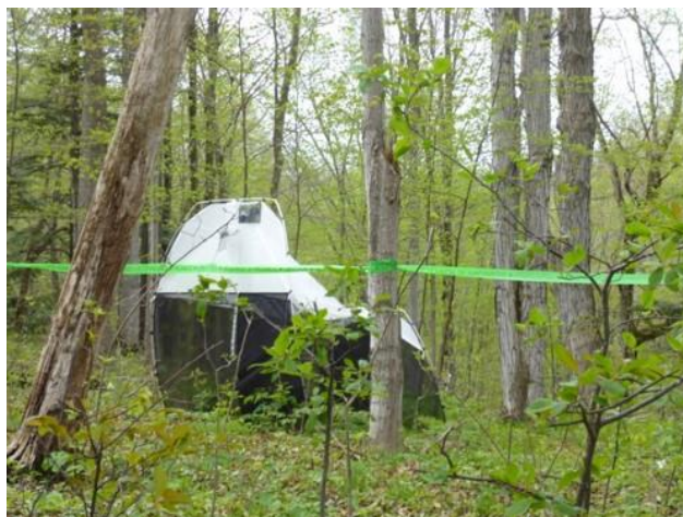
Figure 1. Malaise trap deployed at Morris Tract Provincial Park in 2014.

Over half the BINs captured were flies (Diptera), followed by moths and butterflies (Lepidoptera), bees, ants and wasps (Hymenoptera), and true bugs (Hemiptera; Figure 2). In total, 434 arthropod species were named, representing 29.6% of the BINs from the site (Appendix 1). All but 1 of the BINs were assigned at least to family, and 64.3% were assigned to a genus (Appendix 2). Specimens collected from Morris Tract represent 198 different families and 517 genera.