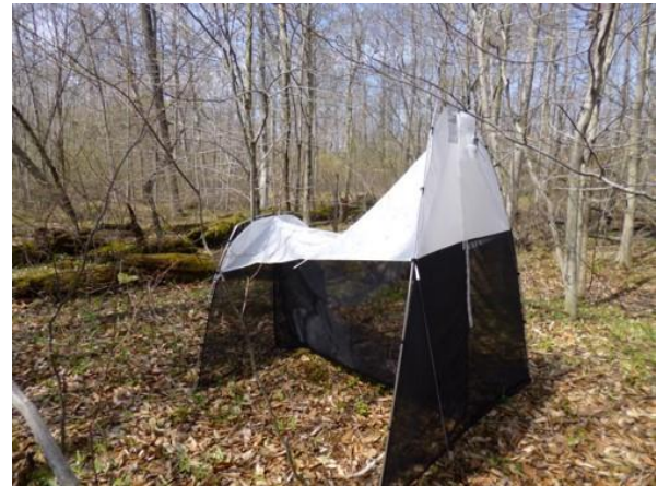
Figure 1. Malaise trap deployed at Rondeau Provincial Park in 2014.

One Malaise trap was deployed at Rondeau Provincial Park in 2014 (42.30206, -81.85306, 239m ASL; Figure 1). This trap collected arthropods for twenty weeks from April 29 – September 16, 2014. All 10 Malaise trap samples were processed; every other sample was analyzed using the individual specimen protocol while the second half was analyzed via bulk analysis. A total of 1248 BINs were obtained.