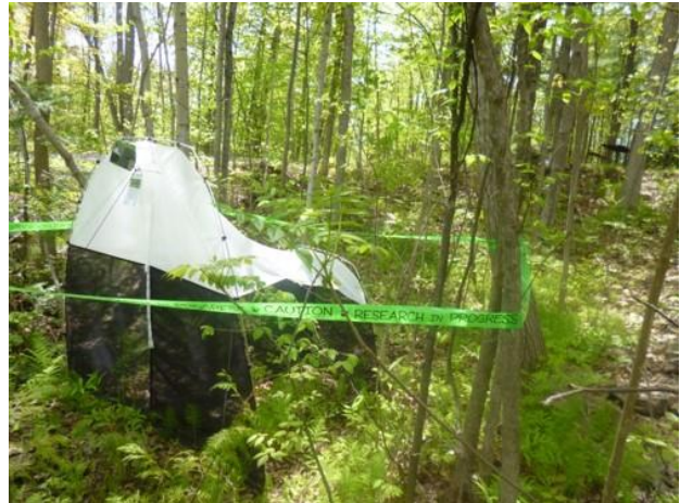
Figure 1. Malaise trap deployed at Sharbot Lake Provincial Park in 2014.

Over half the BINs captured were flies (Diptera), followed by bees, ants and wasps (Hymenoptera), moths and butterflies (Lepidoptera), and beetles (Coleoptera; Figure 2). In total, 640 arthropod species were named, representing 26.8% of the BINs from the site (Appendix 1). All the BINs were assigned at least to family, and 63% were assigned to a genus (Appendix 2). Specimens collected from Sharbot Lake represent 188 different families and 679 genera.