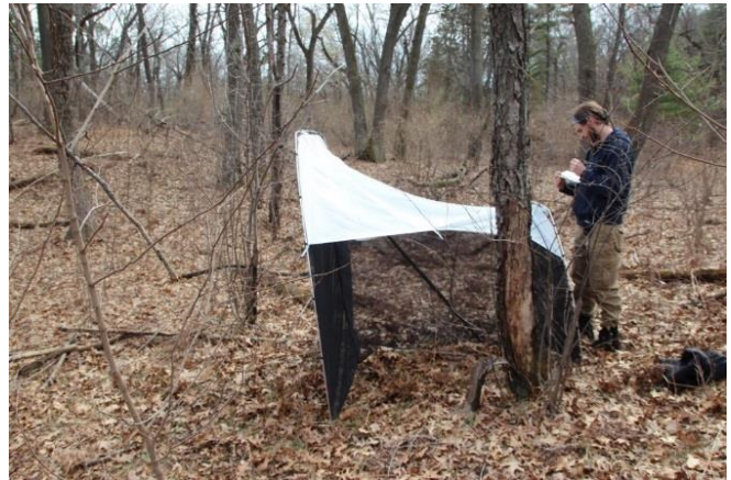
Figure 1. Malaise trap deployed at Turkey Point Provincial Park in 2014.

One Malaise trap was deployed at Turkey Point Provincial Park in 2014 (42.70515, -80.32849, 222m ASL; Figure 1). This trap collected arthropods for twenty weeks from April 28 – September 15, 2014. All 10 Malaise trap samples were processed; every other sample was analyzed using the individual specimen protocol while the second half was analyzed via bulk analysis. A total of 2434 BINs were obtained.