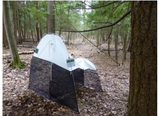
Figure 1. Malaise trap deployed at Wasaga Beach Provincial Park in 2014.

Over half the BINs captured were flies (Diptera), followed by bees, ants and wasps (Hymenoptera), moths and butterflies (Lepidoptera), and beetles (Coleoptera; Figure 2). In total, 278 arthropod species were named, representing 24.5% of the BINs from the site (Appendix 1). All the BINs were assigned at least to family, and 54.1% were assigned to a genus (Appendix 2). Specimens collected from Wasaga Beach represent 177 different families and 379 genera.