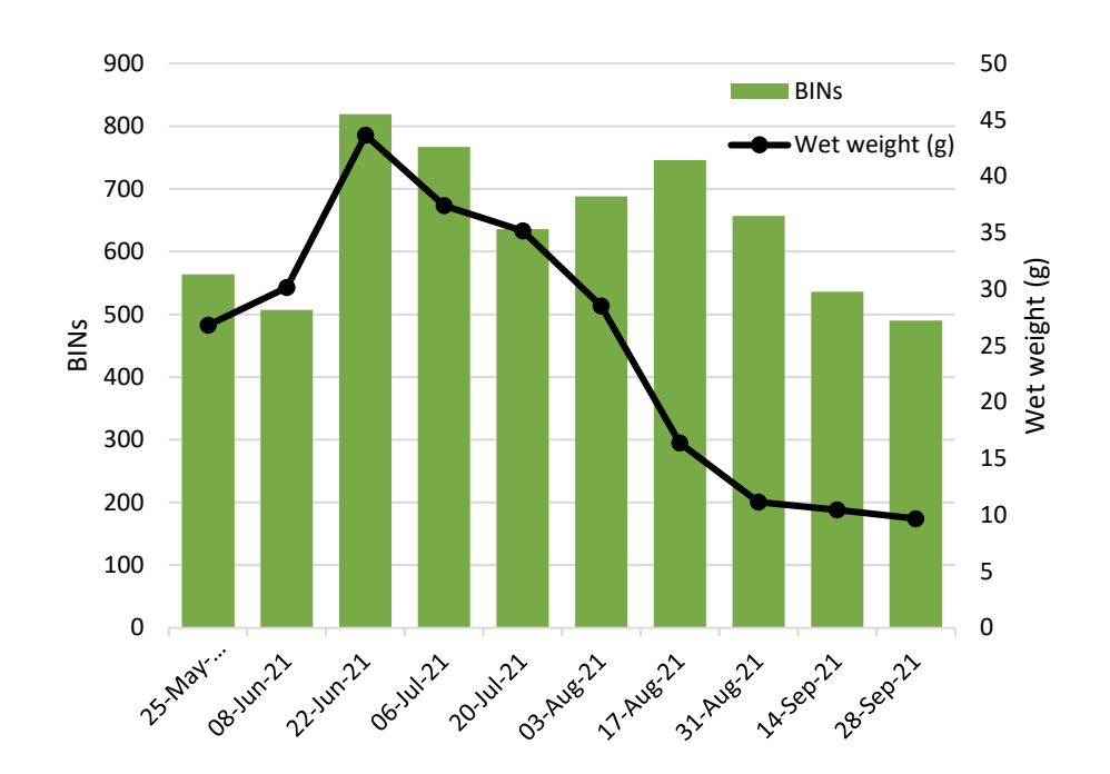
Figure 2. Species diversity (measured by BINs) and approximate insect abundance (measured by wet weight of sample) captured at the trap over the 2021 collecting period.