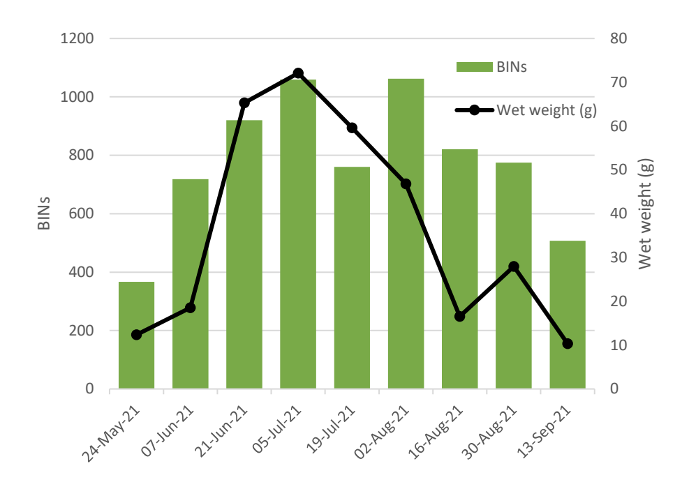
Figure 2. Species diversity (measured by BINs) and approximate insect abundance (measured by wet weight of sample) captured at the trap over the 2021 collecting period.