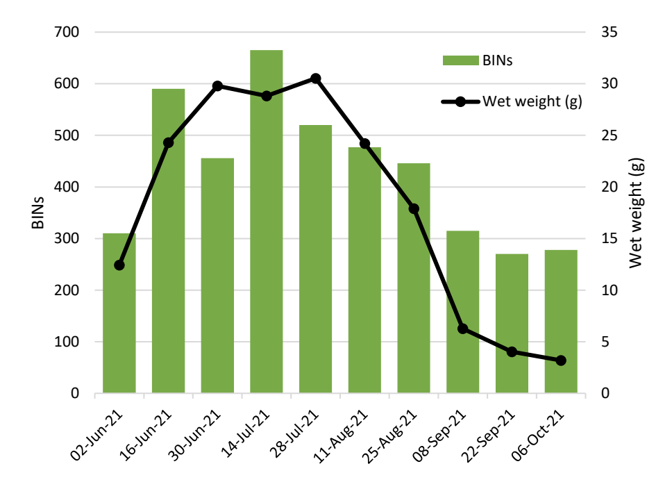
Figure 2. Species diversity (measured by BINs) and approximate insect abundance (measured by wet weight of sample) captured at the trap over the 2021 collecting period.

In total, 613 species were named, representing 28% of the BINs. All BINs were assigned at least to family and 71% of the BINs were assigned to a genus. Specimens collected from this site represent 240 different families and 826 genera. A complete species list is attached separately.