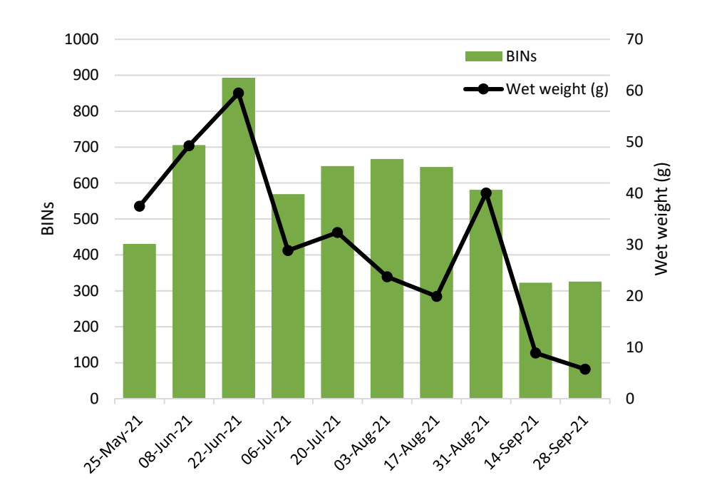
Figure 2. Species diversity (measured by BINs) and approximate insect abundance (measured by wet weight of sample) captured at the trap over the 2021 collecting period.