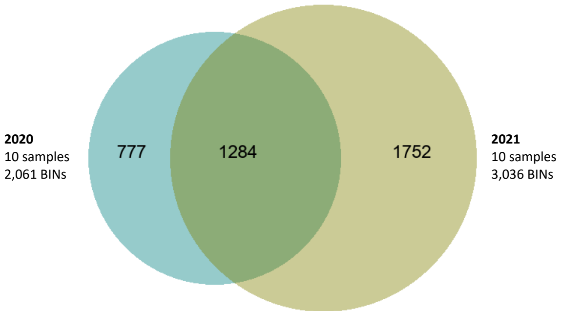
Figure 3. Venn diagram showing the species overlap between the 2020 and 2021 traps.

In combination with the metabarcoding results from the 2020 sampling, a grand total of 3,813 BINs have been captured from Grands-Jardin National Park. There was an overlap of 1,284 BINs between both sampling years and the 2021 trap added 1,752 BINs to the total species pool (Figure 3).