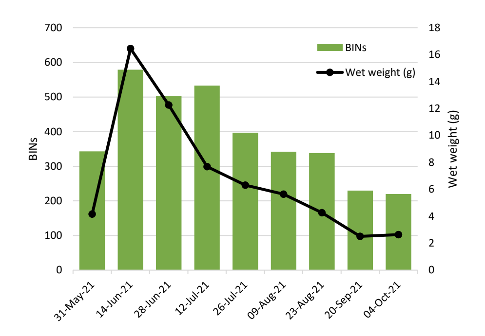
Figure 2. Species diversity (measured by BINs) and approximate insect abundance (measured by wet weight of sample) captured at the trap over the 2021 collecting period.